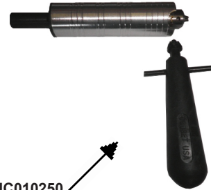
Cod. UC010250 Pieza de mano GROBET de 0 a 8mm Hand piece GROBET from 0 to 8mm