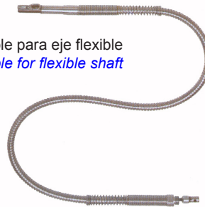
Cable para eje flexible Cable for flexible shaft