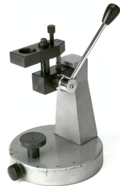
Soporte taladro Drill support Cod. UC010170